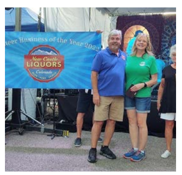
Business of the Year New Castle Liquors