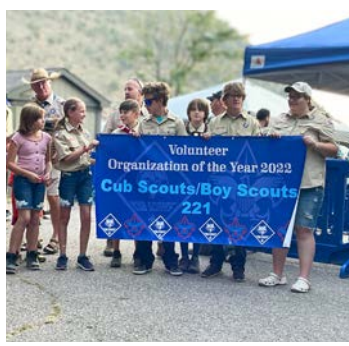
Organization of the Year Cub Scouts / Boy Scouts Troop 221