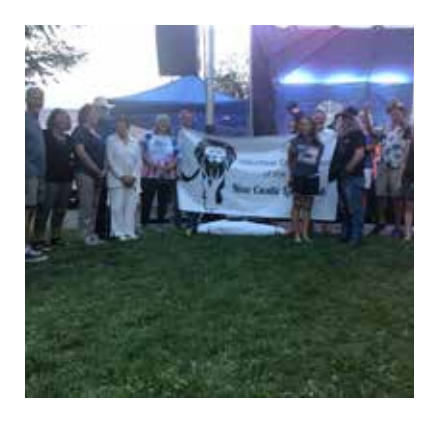
Organization of the Year New Castle Lions Club