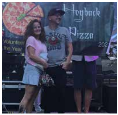
Business of the Year Hogback Pizza